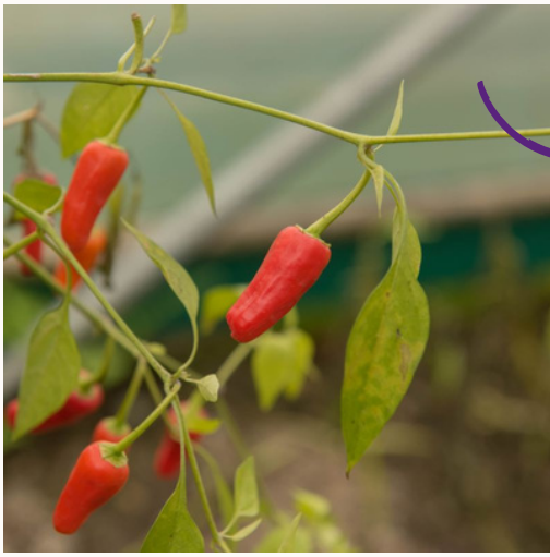
Chilli Pepper 'Apache'